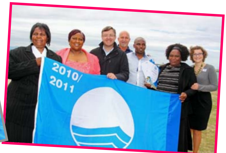
WELL DONE! The Ugu/Hibiscus Coast team who share the honours with the City of Cape Town in having the most Blue Flag beaches in a municipality. (Below) The City of Cape Town team.