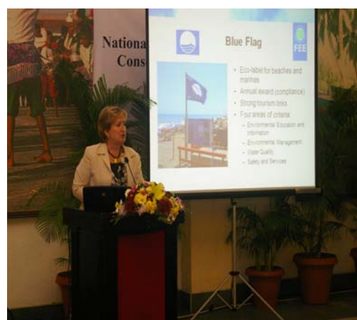
Workshop in the Maldives

The South Asia region is fascinating. Bangladesh, my first stop, is one huge and fertile delta of two major rivers (I did not know that the Ganges flows into the sea in Bangladesh!) and as a low-lying country, is subject to annual monsoon floods and cyclones. While all I got to see in Bangladesh was the capital Dhaka, and the inside of many government buildings, I was told that Bangladesh has the world’s longest unbroken sea beach (over 100km long) at a place called Cox’s Bazaar.